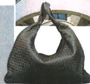
From top: a Bauhaus building in Tel Aviv. Bottega Veneta Ebano Intrecciato Nappa bag, from £1,255. Nemesis by Philip Roth. Pizza East, Shoreditch.